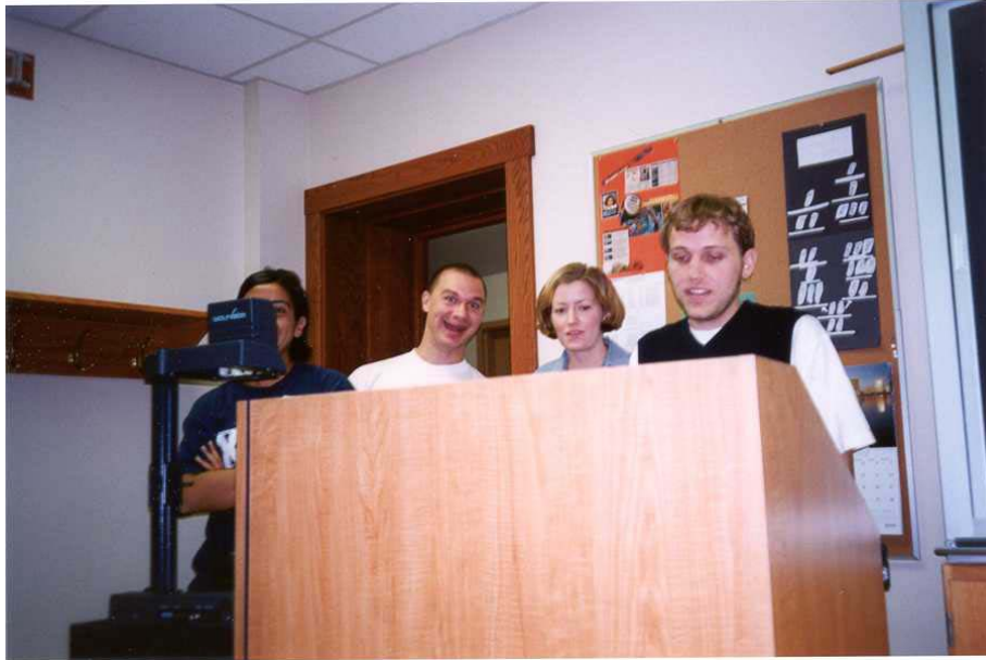
Figure 3. A research team presenting their findings at the podium.

journal article. Teams are required to communicate orally during most of the 14 laboratory sessions (see Figure 3). As Figure 1 shows, the laboratory room is equipped with a podium and LCD projector as well as a document camera. The document camera can be used to view larger animals and plants. It is an extremely valuable piece of